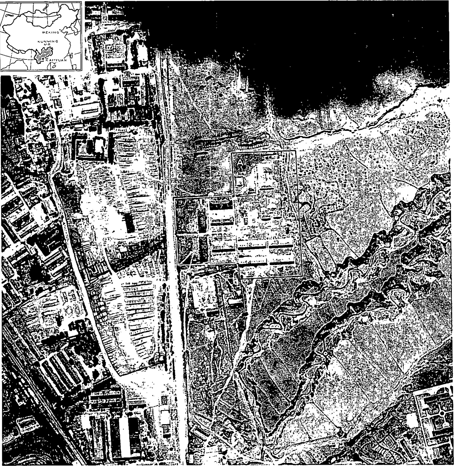
KAI-YUAN ARMY BARRACKS NORTHWEST AL-