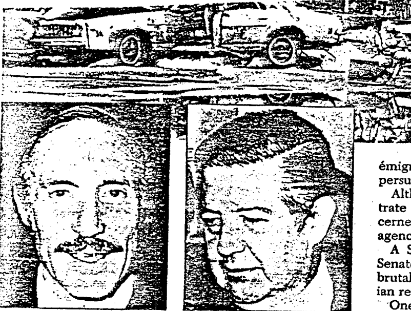
Ex-Envoy Orlando Letelier After the 1976 car-bombing assassination of Letelier, Chilean spy chief Contreras was charged with directing the conspiracy.