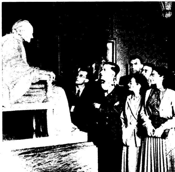
French student delegation in Moscow, 1952