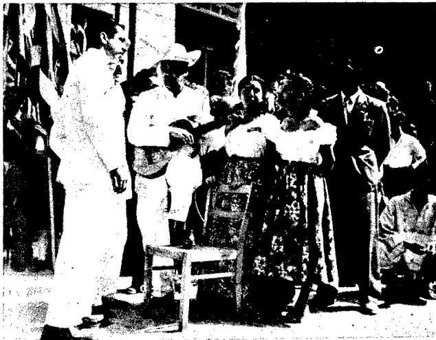
Venezuelan youth and students performing at the IIIrd World Festival in Berlin, 1951.