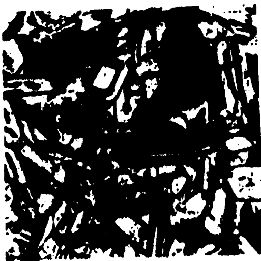
Fig. 5. Microstructure of bacor from center of block. (Transmitted light; magnification 90; parallel nicols.)