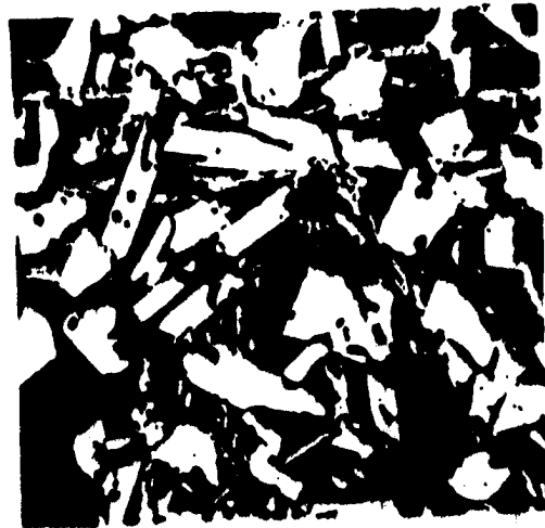
Fig. 4. Microstructure of bacor from working part of block. (Reflected light; magnification 86; parallel nicols.)