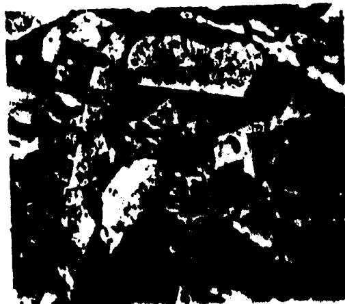
Fig. 6. Microstructure of bacor from center of block. (Reflected light; magnification 165; parallel nicols.)