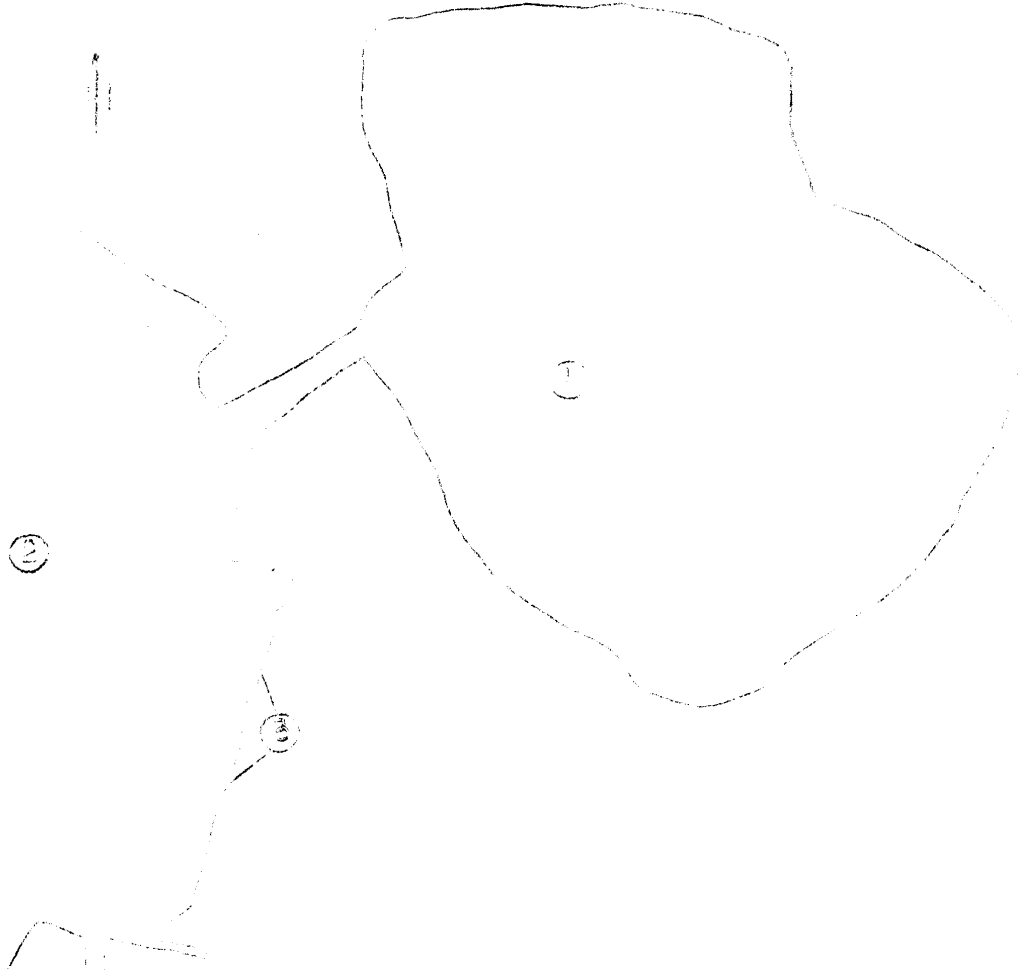
Figure 1 : Overlay of non-standard town plan Stralsund, scale 1:10,000 shipyards in Stralsund