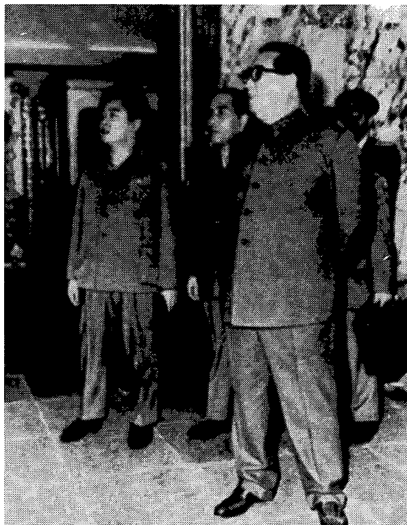
President Kim Il-song and his son Kim Chong-il (left)

The unraveling of the mystery surrounding the term "party center" is in itself an analytical coup of some merit. At first it was thought that the term was merely an abbreviated reference to the Korean Workers Party Central Committee—a group of more than 100 important party leaders that meets once or twice a year in plenary session. An analyst with FBIS noted, however, that the party center was credited with performing tasks and conducting activities that seemed to be more fitting for an individual than a group.