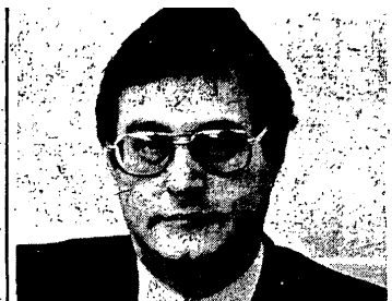
(Victor Marchetti has been in U.S. intelligence activities for almost 20 years, 14 years of that time being with the CIA, the last three years of which he was a staff assistant to Richard Helms. He is the author of "The CIA and the Cult of Intelligence" and "The Rope Dancer.")

In addition to Hunt and Sturgis, another former CIA agent marked for exposure is Gerry Patrick Hemming, a hulk of a man—six feet eight inches tall and weighing 260 pounds. Like Sturgis, Hemming once worked for Castro as a