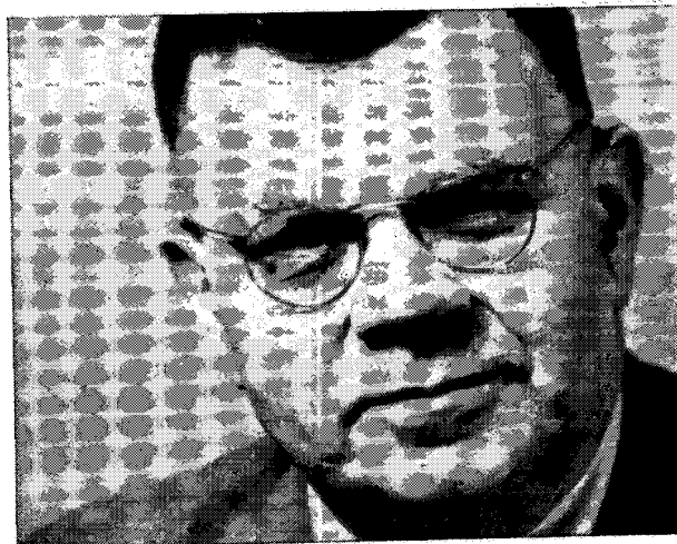
He will try to find out—Dr. Edward Condon, former head of the National Bureau of Standards and recently named director of the Air Force-sponsored civilian investigation of UFO's with headquarters at the University of Colorado