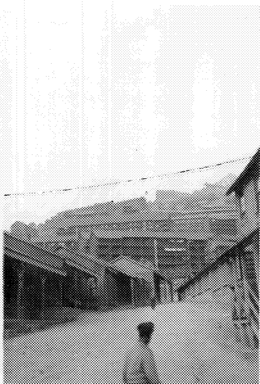
CHILE O'HIGGINS RANCAGUA 34 10 5 70 50 W BRADEN COPPER COMPANY MINES. NOVEMBER 1954. CIA 164525