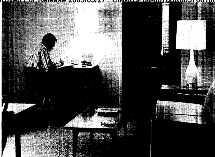
Program participant studies in his apartment.