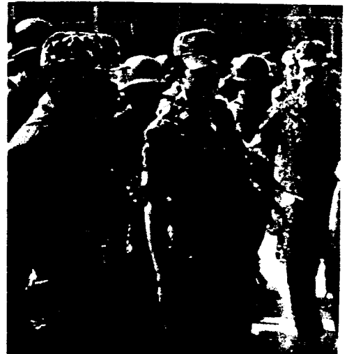
American airman preps Hondurans during

A covert operation to restrict the flow of Cuban arms to El Salvador expands into a larger plan to undermine the Sandinista government in Managua, miring the Reagan administration deeper in Central America.