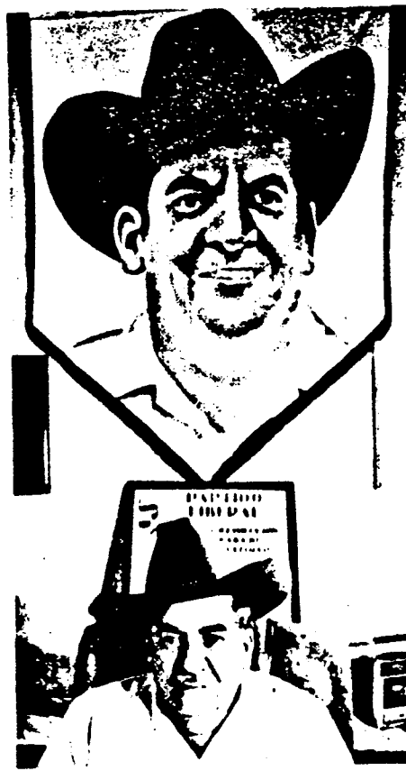
President Córdova: A struggling democracy

Negroponte forged close ties with powerful Hondurans, especially the commander of the armed forces, Gen. Gustavo Aldo Alvarez, who is still the most powerful Honduran in the country despite the election in January of President Roberto Suazo Córdova, the first civilian president in nine years. "They discuss what should be done, and then Alvarez does what Negroponte tells him to," a member of the military high command said matter-of-factly. The two appear to dislike each other personally, said one aide to Alvarez, because "they both run the Army, although only one of them has the title for that job." Alvarez's G-2 military-intelligence agents act as liaisons to the contras and Alvarez himself reports to Negroponte. In addition, two officials in Washington said, Alvarez's military is the main conduit for small arms being delivered to the Nicaraguan exiles and is the main link to Argentine military advisers in Honduras. Alvarez has reason to cooperate: in the past two years, total U.S. assistance to Honduras has totaled $187 million. A $78.3 million aid package has been proposed for 1983.