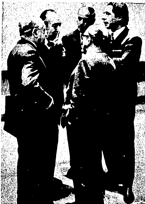
Brazilian Foreign Minister and counterparts from Argentina, Bolivia, Uruguay and Paraguay

Brazil sees such assistance as instrumental in minimizing political instability in these countries, which in return has paved the way for substantial economic benefits for Brazil. In Bolivia, Brasilia secured access to large gas deposits, essential to continued growth of the Sao Paulo - based industrial complex. In Paraguay, the Brazilians gained the right to undertake an ambitious hydroelectric project that will furnish electricity to a large portion of southern Brazil. In