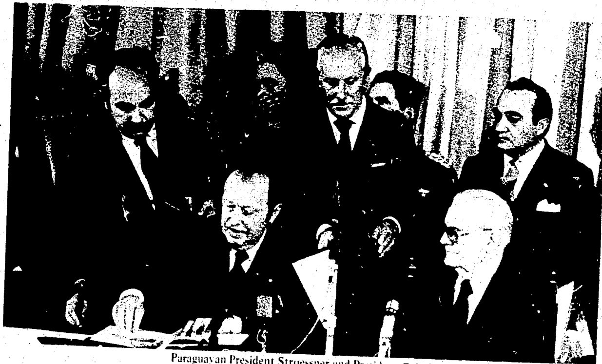
Paraguayan President Stroessner and President Geisel

In Peru, which lost territory to Chile in the same war, military leaders talk of a revenge war by the centenary in 1979.