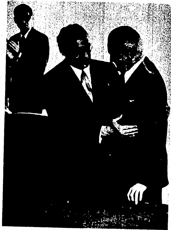
Echeverria and Geisel

As Brazil's leaders contemplate Argentina, they see terrorism, political strife, and economic stagnation—