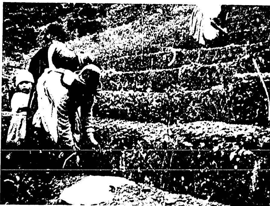
BOLIVIAN INDIANS HARVESTING COCA

6. The coca bush is ready for commercial production after two years and may have a productive life of 30 years or more. There are from two to four harvests a year (depending on the availability of labor, see the photograph), and the average yield is about 2,000 pounds of undried leaf per acre. The crop is dried in stone yards before being pressed and packed into burlap and banana-leaf containers of from 50 to 120 pounds each. The leaf loses about 75% of its weight in the drying process. Although prices vary greatly depending on the supply, the average cost of a pound of dried coca leaf for the local consumer in Bolivia or Peru is about 50¢. Even at these low domestic prices, it is estimated that one hectare (2.47 acres) of coca in Bolivia yields a net return of about $1,600 a year to the producer.