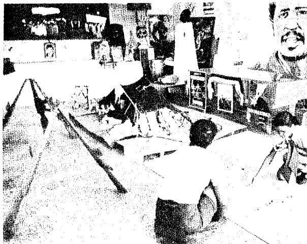
Saharan students in their school's "friendship room." Note the stacked toy rifles in front of a mockup of a desert camp. [redacted] Cuba Internacional ©

Although some recipient countries take special pains to emphasize that courses in Marxism-Leninism are not part of the curriculum, there can be no doubt that substantial politicization takes place at the schools. Marxism-Leninism is the basis of the Cuban educational system, and, while formal classes on the subject may not be part of the curriculum for foreign students, informal indoctrination is achieved through