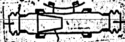
Fig. 1. 1 - ejector; 2 - inlet hose.

ABSTRACT: This Author Certificate describes a mouthpiece housing of a self-contained respiratory apparatus. The device is designed so that, in case of an emergency rise of pressure in the working tract, an ejector is activated. The ejector is set on the side of the inlet hose (see Fig. 1).