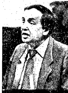
Andrey Voznesenskiy [ ]

Rossiya , recently characterized the requirement that journalists get permission from party officials to publish criticisms as a violation of journalistic ethics. And a February Kommunist article proposed that the CPSU Program require every Communist and "leaders of all ranks" to respond publicly and promptly to media criticism. Other officials have warned that such public airing of dirty linen would harm the regime's reputation. Presumably, the leadership's hesitancy and reluctance to reveal facts about the Chernobyl' nuclear power plant disaster revolved mainly around this question. [ ]