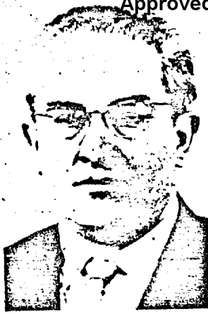
R.B. Andropov, Chairman of the Soviet KGB

"God, it can't be that. What's the matter. It's getting to me." It's impossible." That's what it was — that's exactly what it was.