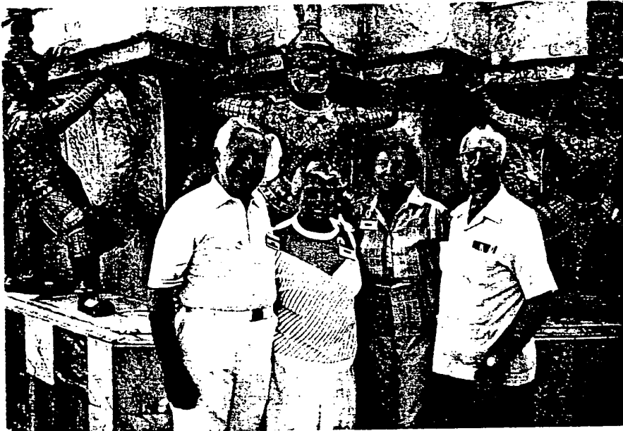
Recalling days of danger and glory: OSS vets and spouses at Bangkok's Grand Palace

Back at Bangkok's Oriental Hotel, the oldsters gabbed away a final evening on the banks of the Chao Phraya, the River of Kings, which flows through the heart of Bangkok. "If I had to launch an operation to blow up a bridge, I'd use one of those rice boats out there to get to the target," said Jones, pointing at a low-slung craft that floated slowly by. There was no war, no bridge, no operation. But there was still a bit of fire left in the warriors from OSS. —By Dean Brelva/Bangkok