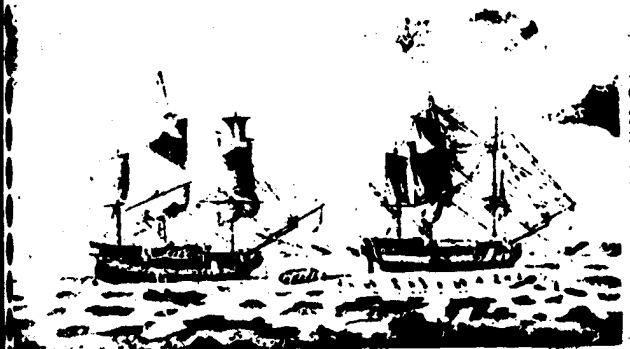
The H.M. Hecla and the H.M. Griper, in search of the Northwest Passage, frozen into the Arctic ice in 1818.

They Thought the NORTHWEST PASSAGE was an All-Water Route to India.