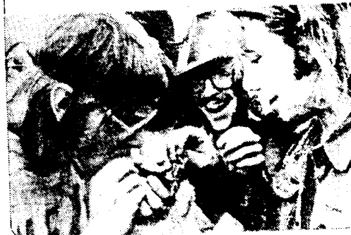
New Solidarity International Press Service

The drug banks and the pot lobby want it — will the U.S. submit?