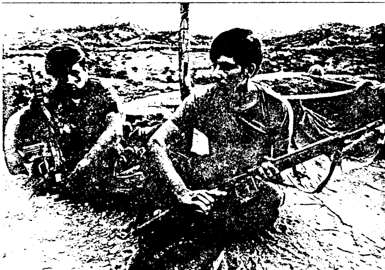
Salvadoran soldiers. "The notion that all massacres of civilians are perpetrated by the government, not by guerrillas, is false."

planes will go from Cuba to Nicaragua or whether additional planes will go directly from the Soviet Union.