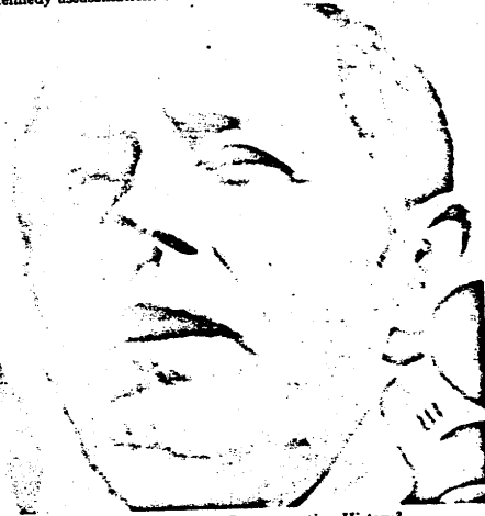
E. Howard Hunt: Reconstructing History?