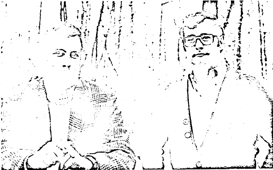
John D. Marks and Ex-Agent Victor Marchetti

Victor Marchetti, 44 years old, is the highest level CIA official to defect to the American public. During his 14 years with the Agency he served as its top expert on Soviet matters and to Third World nations, helping to uncover the missile build-up in Cuba that culminated in the Cuban Missile Crisis of 1962, and as executive assistant to the Deputy Director for a number of years. He had a vantage point from which he was