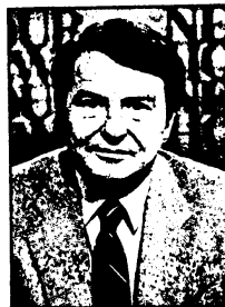
Jim Lehrer Associate Editor and Co-anchor of The MacNeil/Lehrer NewsHour on PBS