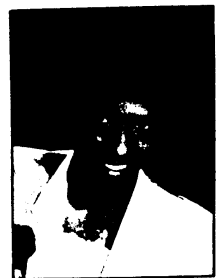
Lynette Woodard Assistant Women's Basketball Coach at the University of Kansas

Miss Woodard is the most prolific scorer in the history of women's basketball. During her career at K.U., her 3,469 points surpassed such greats as Wilt Chamberlain and Jo Jo White. She was a member of the 1980 U.S. women's basketball team at the Olympic Games, and at the 1984 games in Los Angeles, was captain of the team that won the Gold Medal. Miss Woodard is the first woman selected for the University of Kansas Athletic Hall of Fame. Although her list of honors is far too long for such limited space, recent awards have included the 1985 National Role Model from the National Conference of Christians and Jews, and the Outstanding Young Woman of the Year award from the Wichita Jaycee Women. She was the first woman selected for the NCAA Top Five Award, and is the recipient of the coveted Wade Trophy and the Broderick Award. She has excelled in the classroom as well. She received Academic All-American honors in 1980 and 1981, and earned a degree from K.U. in speech communications and human relations. Her career objectives are playing professional basketball, becoming a professional model, and being a public relations representative. It has been said that Miss Woodard, a native of Wichita, is an "all-everything woman." The Kansas State Society is honored to name Miss Woodard a Kansan of the Year.