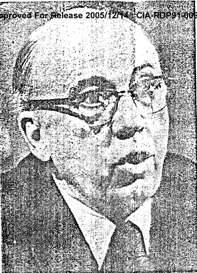
William J. Casey, le nouveau patron de la C.I.A.

pu par exemple prédire le déclin de la production pétrolière soviétique, ils avaient été pris de court par l'invasion de l'Afghanistan.