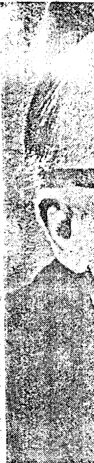
William J. Casey

L'amiral Turner a annoncé la promotion de Carter à l'école navale d'Annapolis, déboulé plus de deux mille employés de la C.I.A. en trois ans. Le moral de l'agence s'en ressent considérablement. Morosité aggravée par les activités anti-C.I.A. d'anciens agents comme Philip Agee.