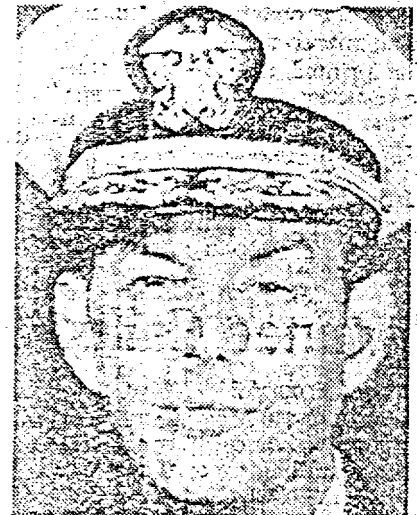
VICE ADM. BOBBY R. INMAN Approval expected

That raised some grumbles inside intelligence organizations, which generally dismiss homosexuals on the grounds that they are vulnerable to blackmail attempts.