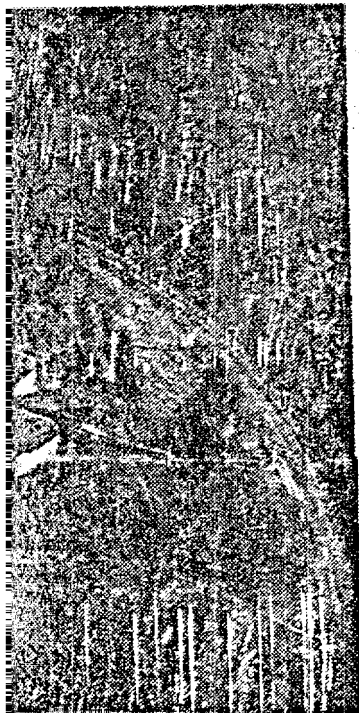
International Agency, à Langley.