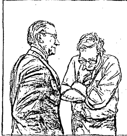
Colby with Seymour Hersh of The Times.

I felt I owed Hersh the interview he requested and could trust his responsibility.