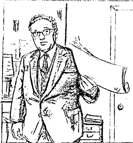
Colby handed Kissinger the “family jewels.”

those storms. It seemed to me that we could do so again—if we handled the present crisis in a calm and sensible way. And in my view, the calm and sensible way in this case was to counter the distortions and exaggerations of Hersh’s article by publicly telling the true story of Operation Chaos and the rest, conceding the Agency’s few misdeeds in the past, explaining how they had come about, emphasizing that they were few and far between and of a relatively minimal nature, and, above all, stressing that they had been terminated by the Agency itself and reported to Congress in 1973 and that nothing of the sort was going on now nor would anything like it take place in the future. More than anything else, it was the CIA’s experience in Watergate that led me to this strategy.