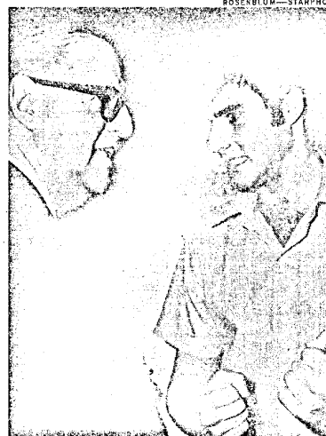
ABBA EBAN & GELLER Under a cloud.

Sprawling over 70 acres of Menlo Park, Calif., the Stanford Research Institute is one of America's largest and best-known think tanks. Its staff of 2,600 highly trained specialists solves problems and does research in nearly every field of human endeavor for both Government and private industry. SRI also does highly classified research for the military, and has worked on counterinsurgency programs in Southeast Asia, explosives technology, chemical and bacteriological warfare and antiballistic-missile systems. For its ser-