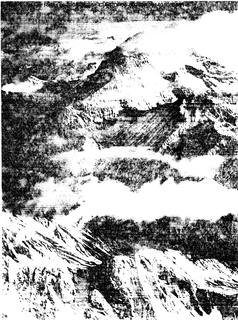
Argentina's "stone sentinel," Aconcagua— tallest mountain in the Western Hemisphere—