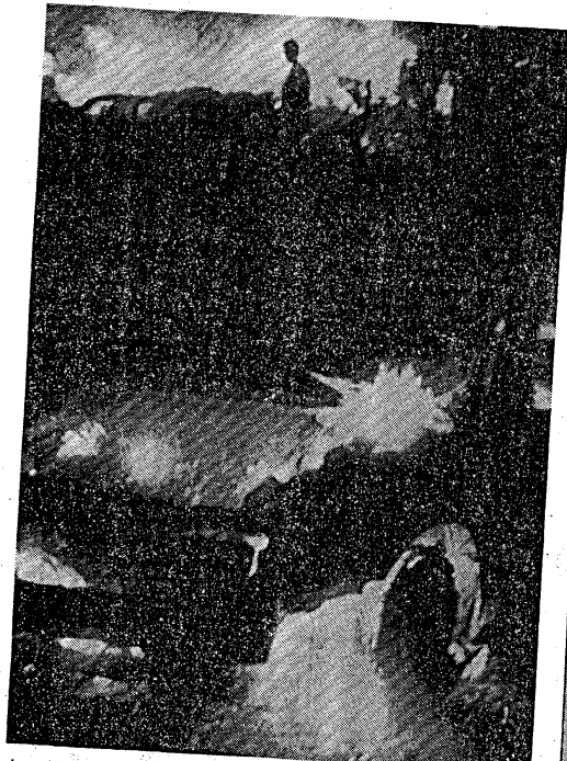
A car blazes in the street following the crash of a Pan American Boeing 747.