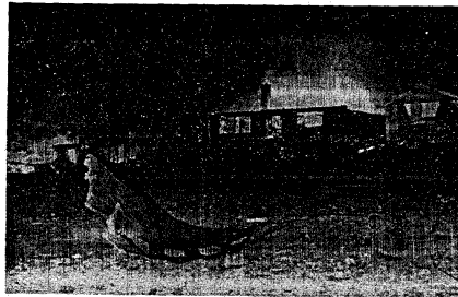
A piece of fuselage lies near burning houses ignited when a Pan American Boeing 747 crashed in Lockerbie, Scotland.

Dead Include 15 Villagers; On-Board Blast Suspected