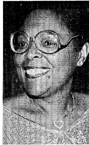
REP. CARDISS COLLINS ... plans hearings on FAA measures

According to the bulletin, the device contained approximately