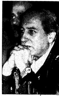
Palestinian terrorist Ahmad Jibril devised the Pan Am jet bombing.

The bomb found in West Germany was built into a Toshiba portable radio, using Semtex H and a triggering device connected to a barometric sensor that sent an electric pulse when it sensed high-altitude air pressure.