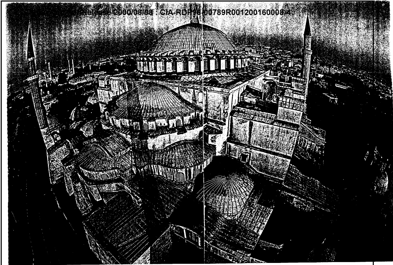
Once the world's largest church, now a museum, Hagia Sophia was dedicated 1,446 years ago by Justinian, who built it on the foundation of an earlier church that