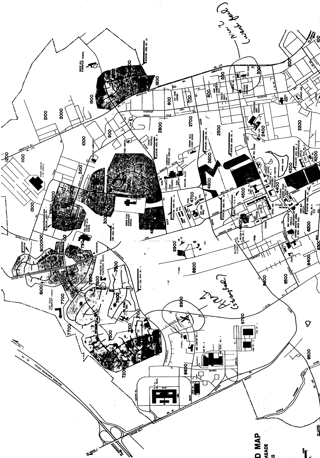
POST ROAD MAP PORT GEORGE G. MEADE MARYLAND 20755