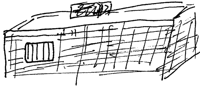
Low brick building with 1 covered window