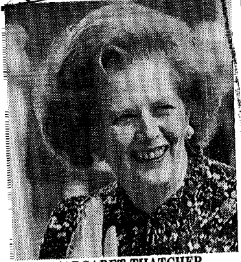
MARGARET THATCHER ... Western Europe's senior leader