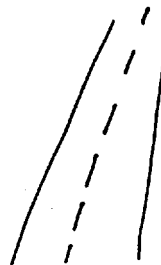
Figure 3. Response with a rating of 1. (Target was a photograph of two long, narrow, distant waterfalls down down two steeply vertical, dark, vegetation covered slopes and coming together near the bottom of the photograph to form a "V" shape.)