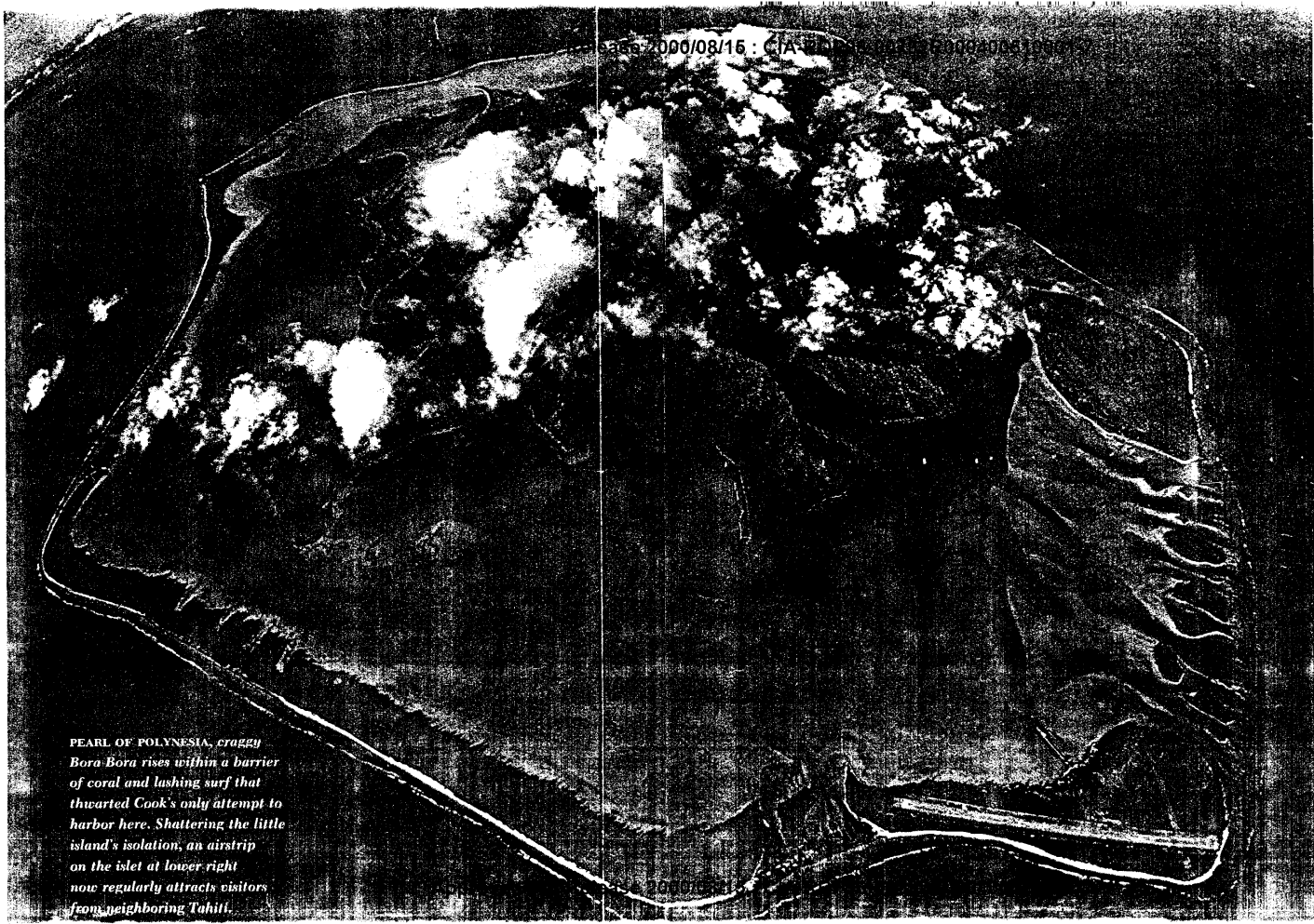
PEARL OF POLYNESIA, craggy Bora Bora rises within a barrier of coral and lashing surf that thwarted Cook's only attempt to harbor here. Shattering the little island's isolation, an airstrip on the islet at lower right now regularly attracts visitors from neighboring Tahiti.