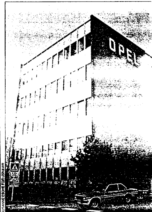
The Opel plant in Russelsheim

To wire other cars, Army intelligence devised an ingenious scheme. Agents discovered that the Soviets had ordered a fleet of customized diplomatic cars from the Opel plant in Russelsheim, 15 miles from Frankfurt. The agents developed a plan to gain access to the plant at night, take apart the car, install a sophisticated transmitter into its frame and re-