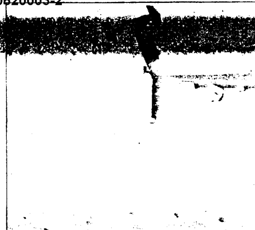
Quick Response: The custom Star Wars choppers

Enter the Special Operations Division. It leased a Beechcraft King Air 100, a versatile airplane with a range of 1,200 nautical miles, and flew it to Nashua, N.H., where the division paid hundreds of thousands of dollars to an electronics firm to install state-of-the-art communications, electronic eavesdropping and aerial-reconnaissance equipment so sensitive that it could pick up ground radio communications even when flying at altitudes above 25,000 feet. Seaspray then transported the plane to San Pe-