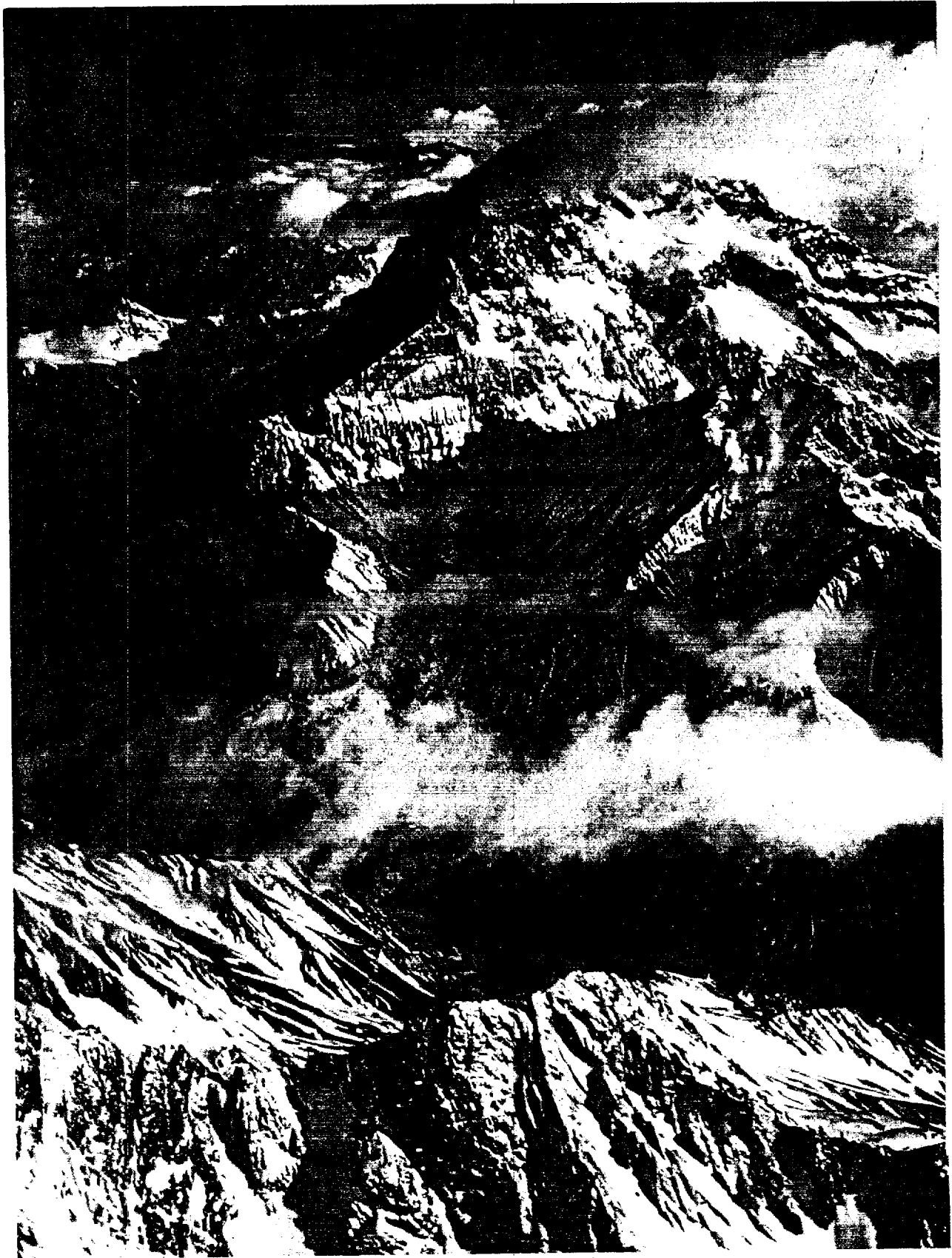
Argentina's "stone sentinel," Aconcagua—tallest mountain in the Western Hemisphere—