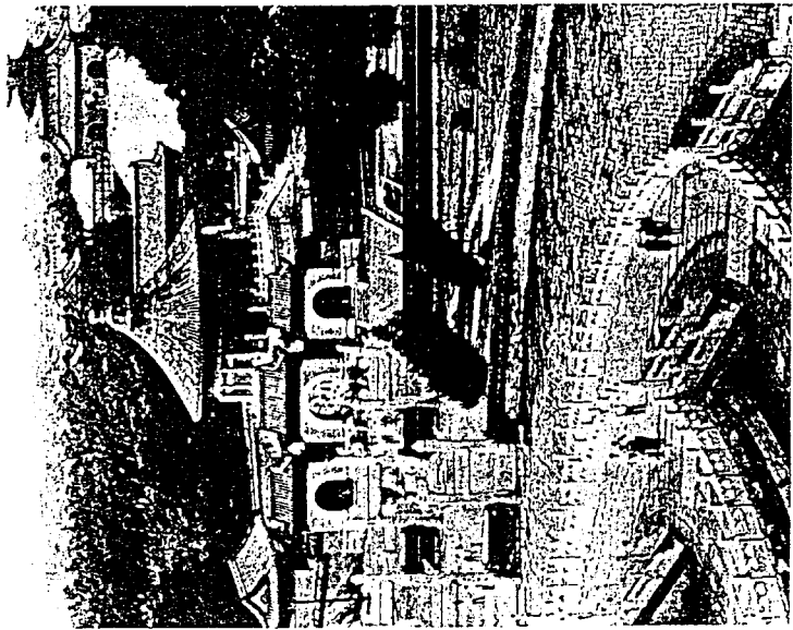
Figure 36. The Altar of Heaven. This northward view from a point near the main altar looks over the Temple of the God of the Universe (center) to the gateway of the Hall of Annual Prayers (background).