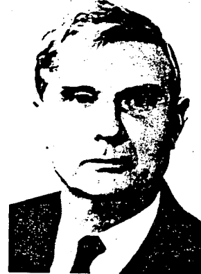
Mikhail A. Suslov

4. In late 1969 there were reliable reports that Brezhnev was under fire from Suslov, Shelepin, and Mazurov for lack of dynamism and a tendency to tread water on policy questions. His efforts to increase the cohesion of the Communist world were frustrated, and the stalemate with China persisted.