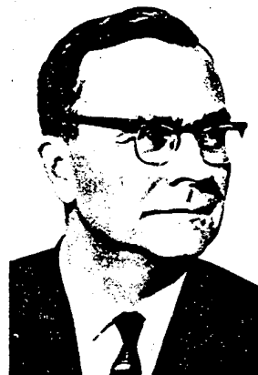
Gennady I. Voronov

capital investments in the agricultural sector. He vigorously campaigned for the adoption of the controversial "link" system of organizing farm labor, a system that, to the ideologically orthodox, smacks of private farming.