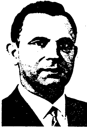
Dmitri S. Polyansky

21. Brezhnev can take comfort in the fact that most of the important spokesmen for conservative causes had either been removed from office before the detente policy got under way or were sufficiently beholden to him politically to ensure their compliance. One influential foreign policy conservative, Leningrad party boss Tolstikov, was maneuvered out of the country as ambassador to Peking before the 24th party congress. His successor appears to be somewhat more open to Brezhnev's blandishments, and as a "new boy" carries considerably less weight than had Tolstikov.