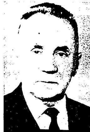
Aleksey N. Kosygin

11. Premier Kosygin suffered a slight loss of status at the congress. He dropped from second to third place, behind President Podgorny. One of the principal spokesmen for closer Soviet relations with the West, Kosygin has steadily been pushed aside as Brezhnev assumed leadership in this field. It was Kosygin who visited France in 1966 and England in 1967, and who met with President Johnson at Glassboro later that year. But in 1971 it was Brezhnev who traveled to France and met with Brandt. While Kosygin welcomed Brezhnev's support for