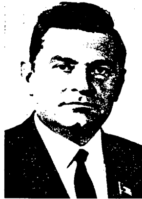
Kirill T. Mazurov

22. Critics could arise from within Brezhnev's own political circle. Polyansky, for example, reportedly sought in the pre-congress period to appeal to hardliners by supporting their positions on a variety of cultural matters. He is said to have even flirted from time to time with the ultra-conservative neo-Stalinists. But Polyansky is indebted to Brezhnev for support on agricultural policy. Moreover, Polyansky's most visible rival to succeed Kosygin when the premier steps down is Mazurov, whose ties are with Brezhnev's critics. If Polyansky is ambitious, as is likely, his ambition would seem to be best served by loyalty to Brezhnev. The same holds true for Kirilenko, who displayed a marked conservative