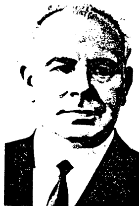
Nikolay V. Podgorny

12. Not only has Brezhnev encroached on Kosygin, but Brezhnev also has helped his political ally, President Podgorny, to do likewise. The last-minute inclusion of Brezhnev and Podgorny in what were originally scheduled as private talks between Kosygin and Mrs. Gandhi had every appearance of a deliberate elbowing in on Kosygin. The premier has had a special interest in relations with India, at least since the Tashkent Conference in 1966.