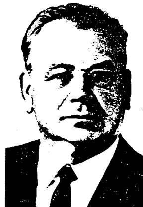
Andrey P. Kirilenko

39. With Brezhnev at the ceremony were the "Moscow Ukrainians," Podgorny, Kirilenko and Polyansky--the last two being prime beneficiaries of Voronov's removal. Those leaders who would seem to have had the most to lose from Voronov's political demise and who probably opposed his ouster--Kosygin, Suslov, and Shelepin--were absent, perhaps as a deliberate gesture to dissociate themselves. Moreover, rumors began once again to circulate about Kosygin's impending retirement, due to "ill health." It is true that Kosygin has health problems of long standing. They do not, however, seem to be of an incapacitating nature thus far. Rumors of his retirement because of poor health, which recur sporadically have not coincided with any of the identifiable periods where the Premier was ill and seem to be less a reflection of any such intention on Kosygin's part than a symptom of temporary political weakness. They may have been started by others in the leadership eager to see him go.