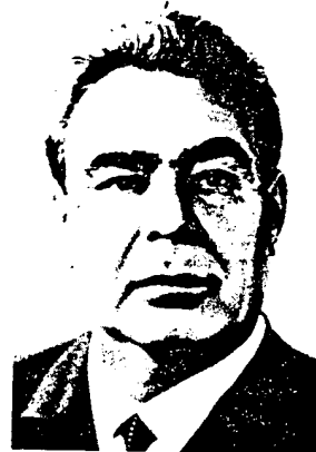
Leonid I. Brezhnev

To some extent Brezhnev simply has taken advantage of events at home and reacted to developments elsewhere. As the prevailing view has shifted within the Soviet leadership, particularly in foreign affairs, Brezhnev, a perennial middle-grounder, has moved with the tide. But Brezhnev is first and foremost a politician, and in the past year he has taken the lead in assuming public responsibility for controversial policies. His colleagues probably recognize that Soviet interests abroad are best served when there is one undisputed leader able to speak with full authority.