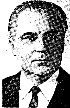
Vladimir V. Shcherbitsky

31. The split between Shelest and Shcherbitsky, the latter a proxy for Brezhnev, was much in evidence at the congress. Scherbitsky stressed that the labor of all the Soviet people formed the basis of Ukrainian success, and added that "great credit" was due to those in Moscow who were unflagging in their concern for all the republics. Shelest's speech, in contrast, contained no word of thanks to the Great Russians. Instead, he insisted that the shoe was on the other foot--that the Ukraine was responsible for a great part of the nation's production. Shelest was joined in this stance by the same republic party bosses who before the congress had shown the greatest reluctance to praise Brezhnev personally.