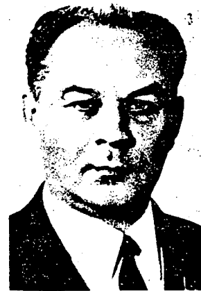
Aleksandr N. Shelepin

1. In the early days of the collective leadership, the principal challenge to Brezhnev came from the ambitious Shelepin who spoke for neo-Stalinism and rode the wave of reaction against Khrushchev. Brezhnev, in classic political style, moved with the flow of conservatism to limit the ground available to Shelepin, at the same time undermining Shelepin's political base. By late 1967, Brezhnev had control over the conservative wing of the party, and Shelepin had been reduced to the politically powerless post of trade unions chief.