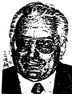
Franjo Tudjman Croat President