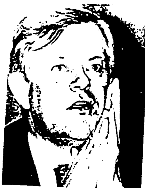
Milan Kucan Slovene President