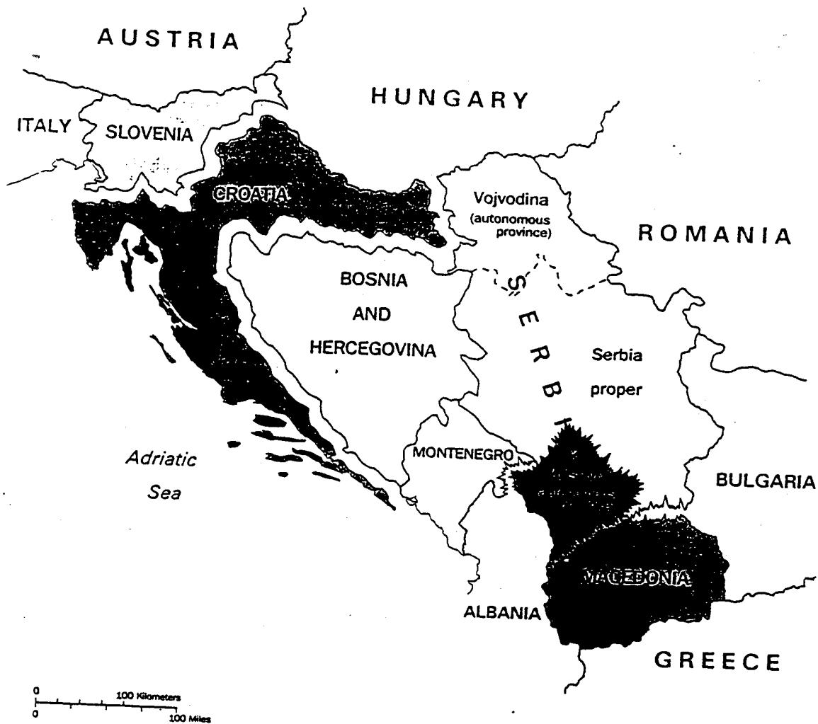
Figure 2 Dissolution in Yugoslavia