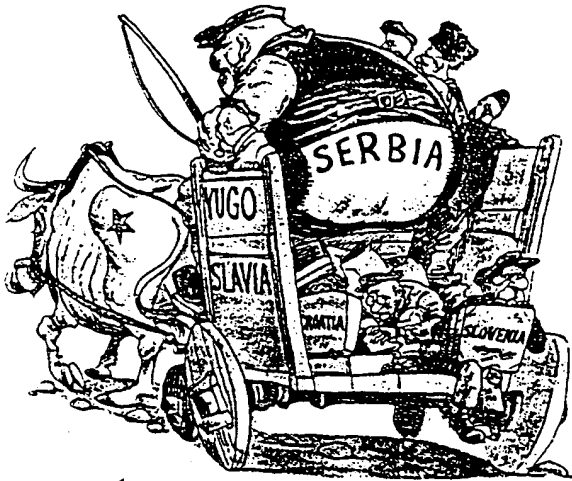
Figure 1. [REDACTED]

Serbia during the span of this Estimate will probably refuse to accept the minimal conditions set by Slovenia and Croatia for continuation of an all-Yugoslav state. [REDACTED]