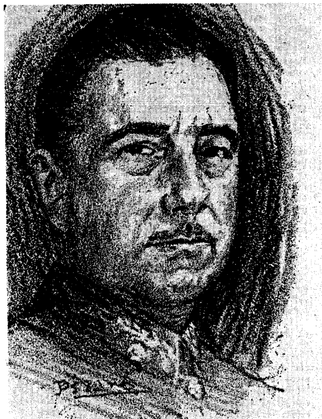
President Pinochet The decision will be his

Progress on prisoners and efforts to curb abusive practices notwithstanding, however, the government is far from complacent where internal security is concerned. Dagnet sweeps for common criminals and leftist fugitives were undertaken in Santiago late last month after a half-year hiatus. President Pinochet has promised new interim security legislation this month. It will probably be designed to fill gaps in existing laws until the eventual promulgation of an omnibus legal code.