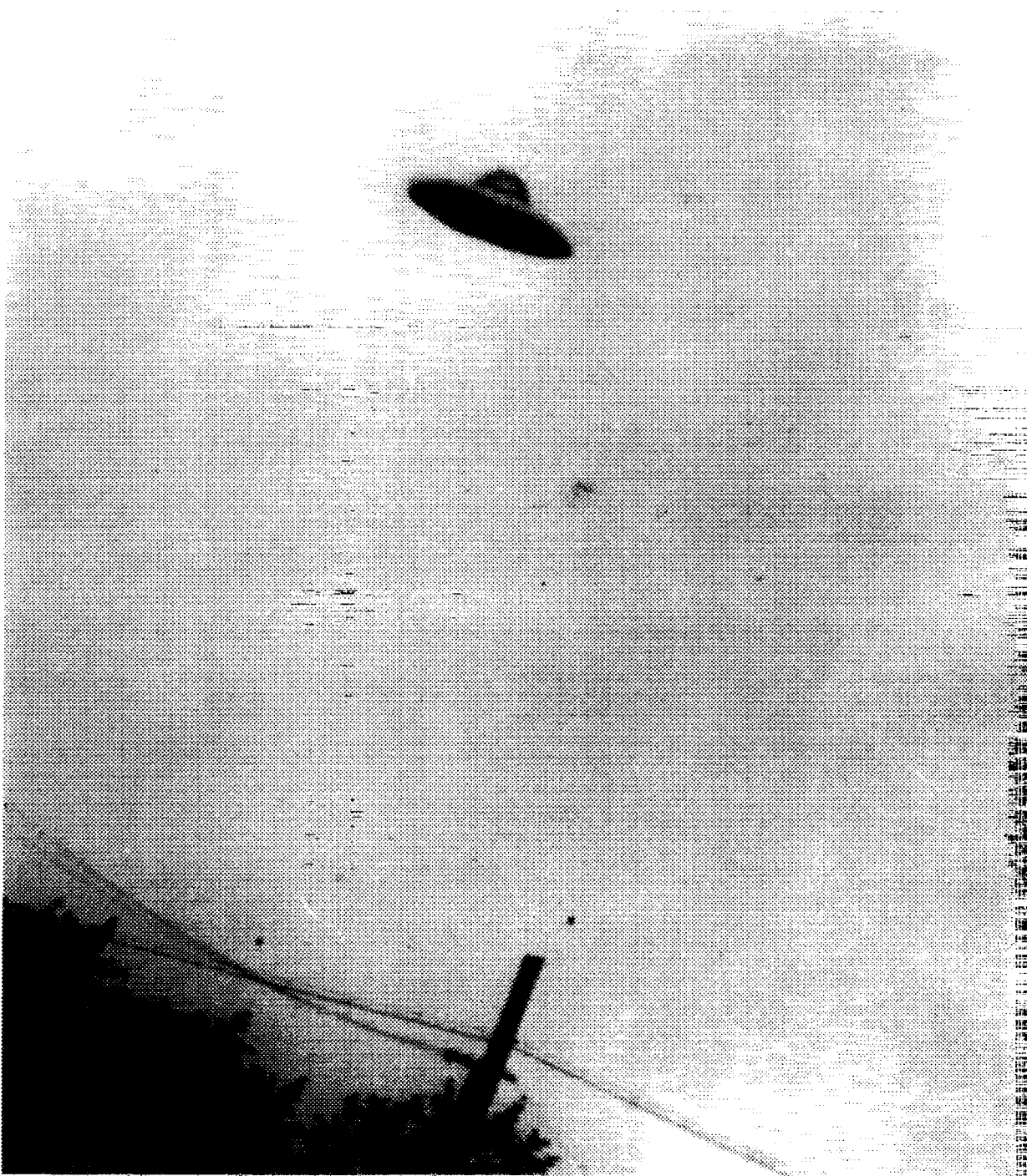
Passoria, New Jersey, 31 July 1952.