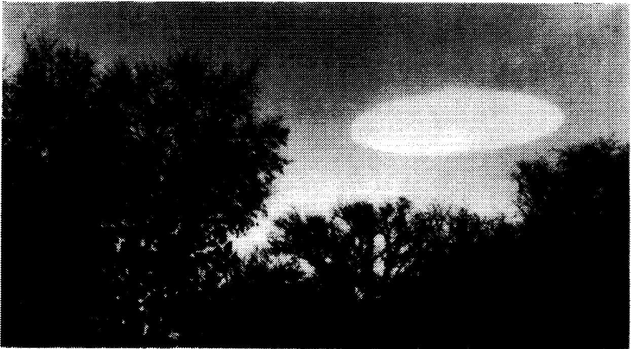
Minneapolis, Minnesota, 20 October 1960.