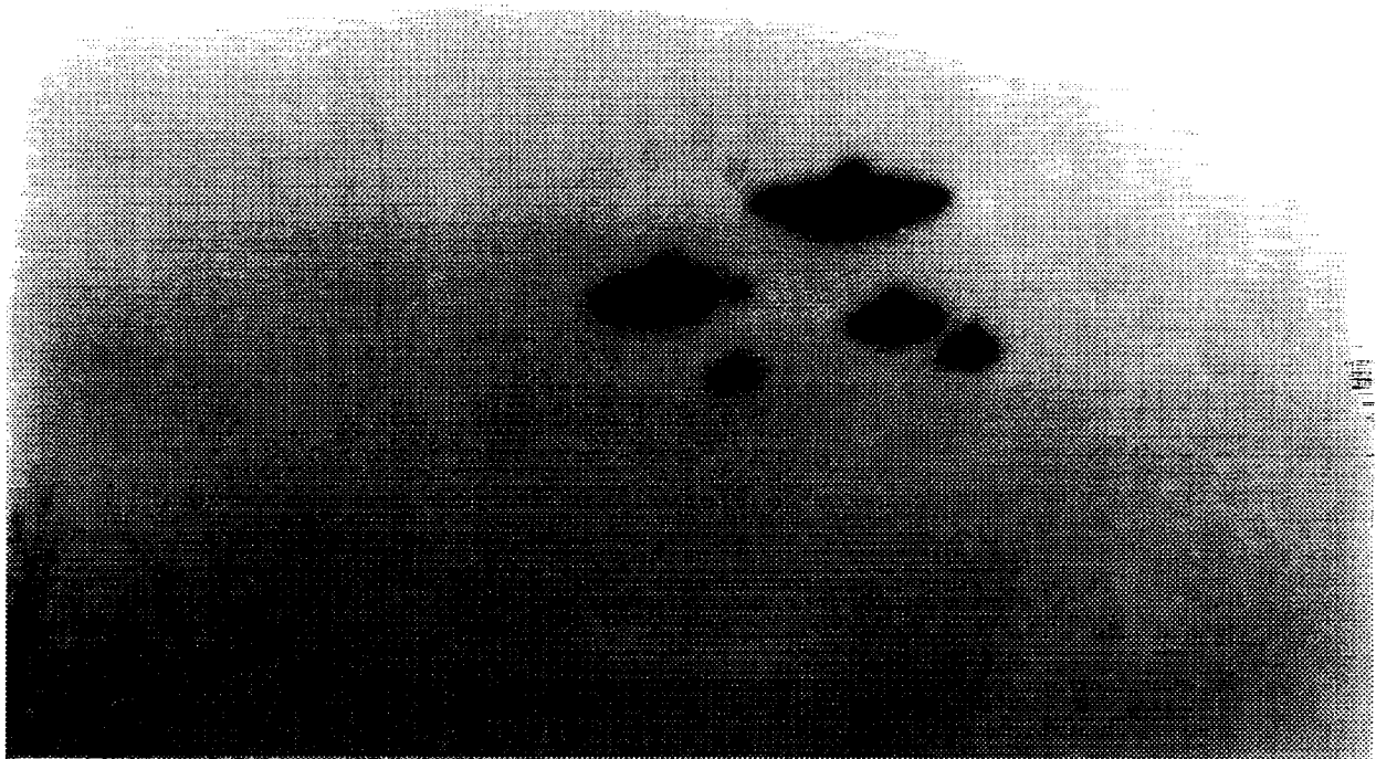
Sheffield, England, 4 March 1962.