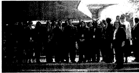
(U) Agency employees welcome actor Gil Bellows to Headquarters.

Through that very long day they were always available, helpful, and knowledgeable about the location of every switch, outlet, and widget. Their continuous assistance and support were invaluable to making our day.