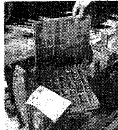
Plate for counterfeit British pounds recovered from Lake Toplitz in 1959 during a search sponsored by the German magazine Stern . The Austrian government conducted its own recovery operation four years later, surfacing additional artifacts. (U)

By 1939, the German Reich had begun to formulate a plan to undermine the economies of the British Empire and the United States through currency destabilization. 3 Known as Operation Bernhard, the plot was launched by SS officers Alfred Naujocks and Bernhard Kruger of the Reichsicherheitshauptamt (the German Security Main Office, or RHSA), who