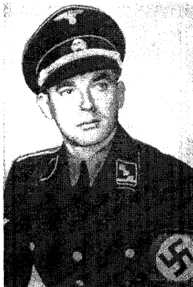
Bernhard Kruger, in charge of counterfeiting at Sachsenhausen concentration camp. (U)

The Germans faced numerous technical difficulties in counterfeiting British and American money. By mid-1943, the SS had contracted with the Hahnenmuhle paper factory in Braunschweig in northern Germany to make the special rag needed to replicate British money. The Germans used ink produced by two companies in Berlin. Wartime shortages, coupled with imperfections, limited