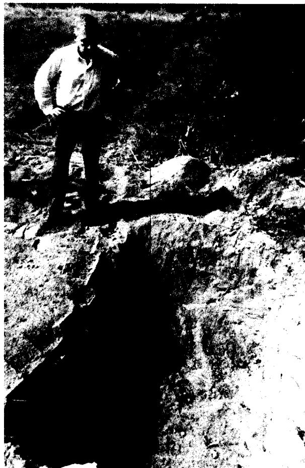
US Ambassador Robert White stands over the shallow grave in which four US churchwomen were buried following their torture and murder by members of the National Guard in La Paz Department, 2 December 1980. (U)

Reflecting their distaste for the negotiation process, ultrarightist leaders in the Assembly are already maneuvering to block an administration proposal for broad amnesty for the insurgents, as indicated by US