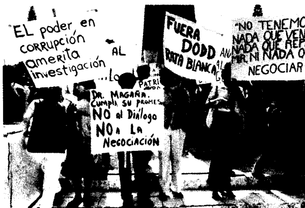
Conservative women's group confronts visiting liberal US legislators in January 1983 with protest signs demanding that Salvadoran President Magana refuse to dialogue or negotiate with the rebels and calling Senator Dodd a "white rat." (U)