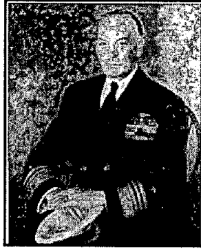
Roscoe Henry Hillenkoetter