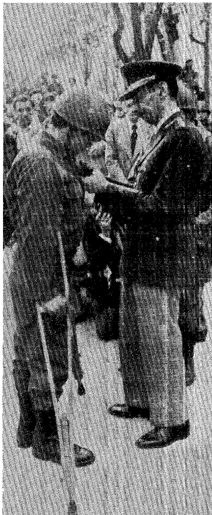
President Videla pins a medal on soldier wounded in combat against leftist guerrillas in Tucuman Province

Advocates of such harsh tactics view the success the security forces have had