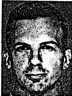
LEE H. OSWALD