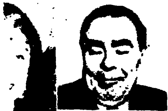
II the life

STAR TV ON YOUR MARX: Political insiders are stunned by a story coming out of the atheistic Soviet Union about the sudden improvement in the health of Leonid Brezhnev. A year ago his walk was unsteady and his speech close to incoherent, but now the Soviet leader appears hale and hearty. The rumor is that Brezhnev owes his recovery to a Georgian faith healer who reads auras. That's Georgian as from Soviet Georgia, not the Miss Lillian variety.