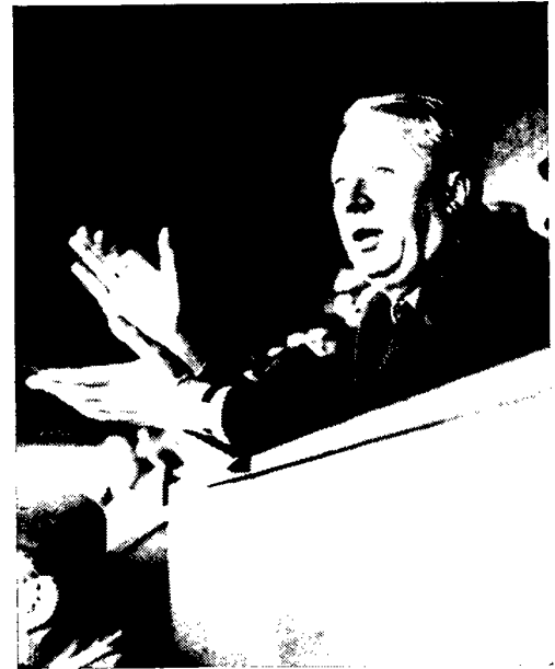
HEATH Full cry.

dared to defend the pound with the simple old-fashioned remedy of deflating demand at home. Defying his own anti-war left wing, Wilson has consistently—often brilliantly—defended the U.S. position in Viet Nam. Refusing to be frightened into precipitate action on Rhodesia, he hopes that economic sanctions ultimately will resolve the rebellion without bloodshed.