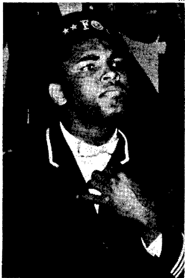
CASSIUS CLAY No battle at Verdun.

Even though he looks militant enough in the dress blues of the Fruit of Islam, the Black Muslims' Special Forces, Boxer Cassius Clay, 24, is a peaceful sort—as he loudly announced to the U.S. Selective Service when it reclassified him 1-A. "I don't have no quarrel with those Viet Congs," blared the Greatest. So the