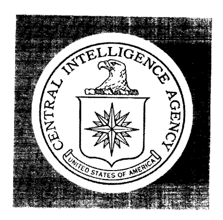
DIRECTORATE OF INTELLIGENCE