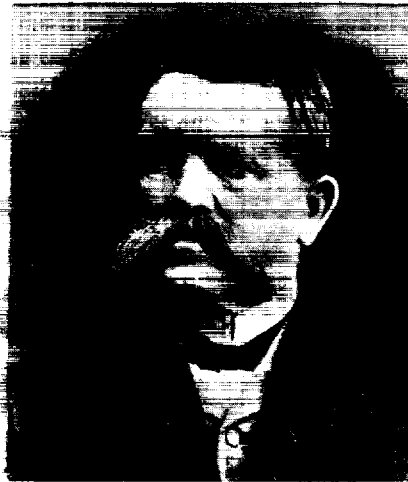
Alois Hitler -- Hitler's father. Note resemblance to Hindenburg.