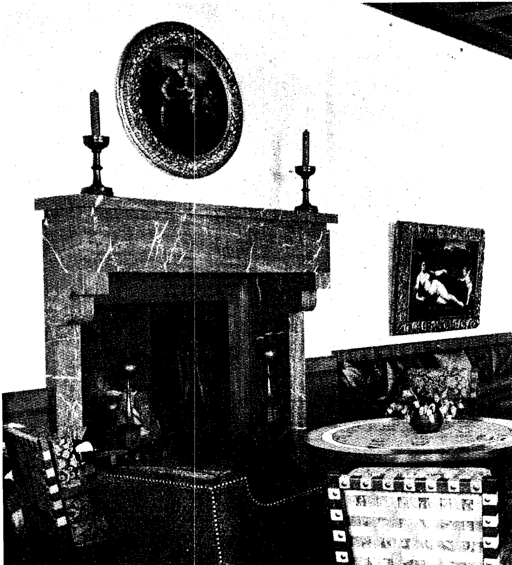
Corner of Big Room at Berchtesgaden. Painting of Madonna & Child over mantel.

From these and other bits of evidence we can conclude that Hitler loved his mother and hated his father, that he had an Oedipus Complex , in other words. But, as we shall soon see, this can explain only one phase of his relationship to his parents.