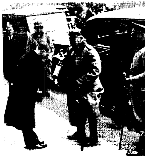
Note the subservience of Hitler's bow.

(iii) Heiden: In the midst of the Munich Putsch Hitler exclaimed to Kahr in a hoarse voice: "Excellency, I will stand behind you as faithfully as a dog!"