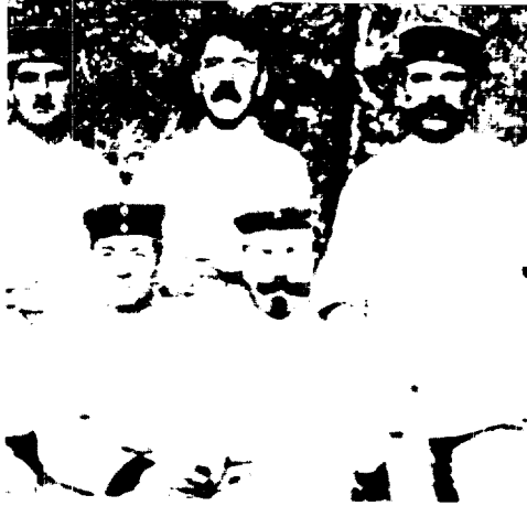
Hitler with fellow patients at Pasewalk, 1918

was after hearing the news of her capitulation that he had his vision of his task as savior. Suddenly his sight was restored.