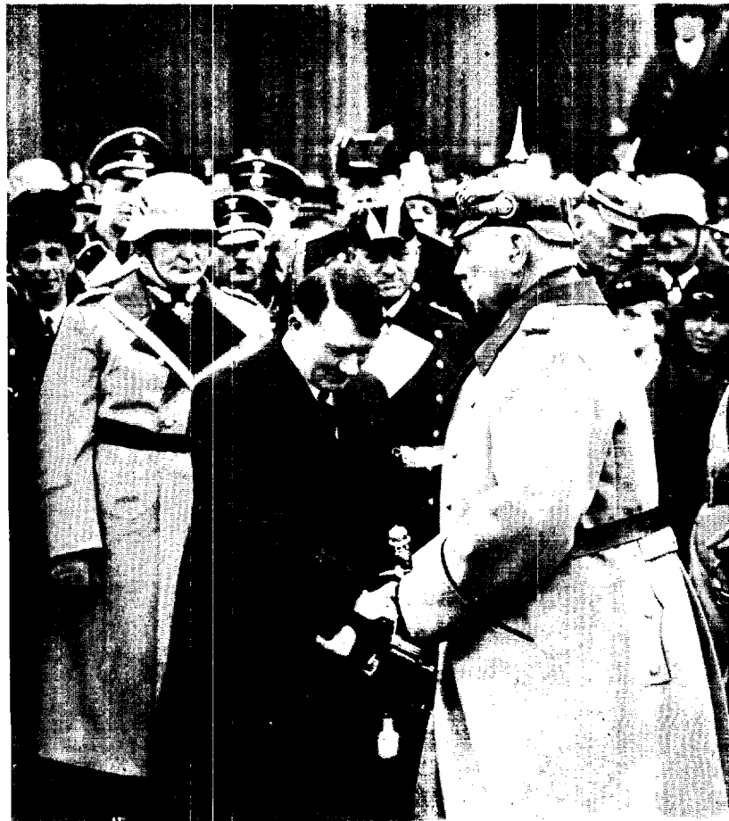
Hitler and President Hindenburg on the Day of Potsdam March, 1933

(ii) Strasser: Hitler's attitude towards the General was obsequious; he was in agreement with everything Ludendorff said.